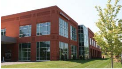
Building III features private tenant entrances.