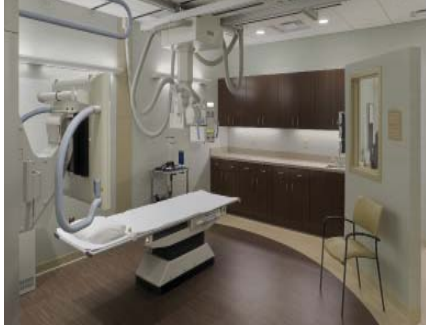
Interior finishes include hardwood flooring and cabinetry.