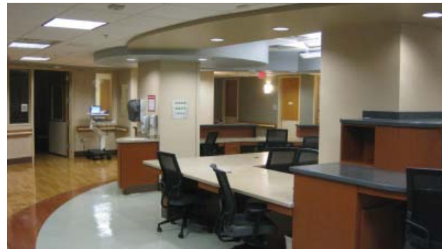
ICU Renovation - Nurses Station