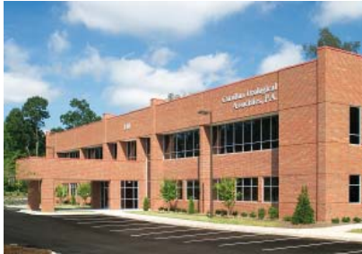
140 Kimel Park