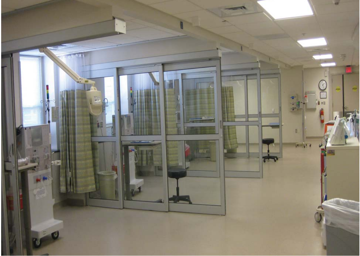
Hemo Dialysis Unit Renovation