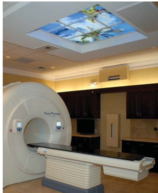
Sky Ceiling System

The cancer center features a sky ceiling system, custom cherry cabinets and tile counter tops and floors. Careful planning and team meetings ensured surrounding medical offices were not disturbed during construction.