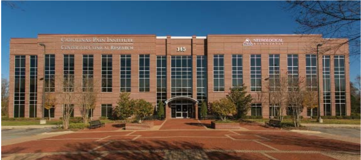
145 Kimel Park