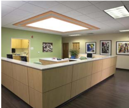
Integrated ceiling lights provide soft light for the reception area.

The building was constructed with structural steel, brick veneer walls, and a TPO membrane roof system.