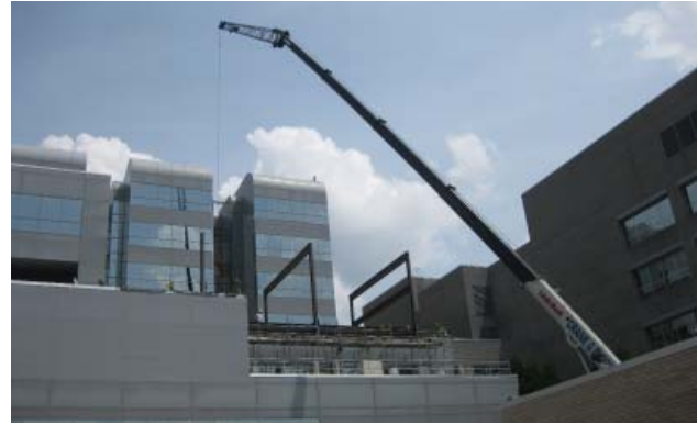
Penthouse Addition - Construction Photo