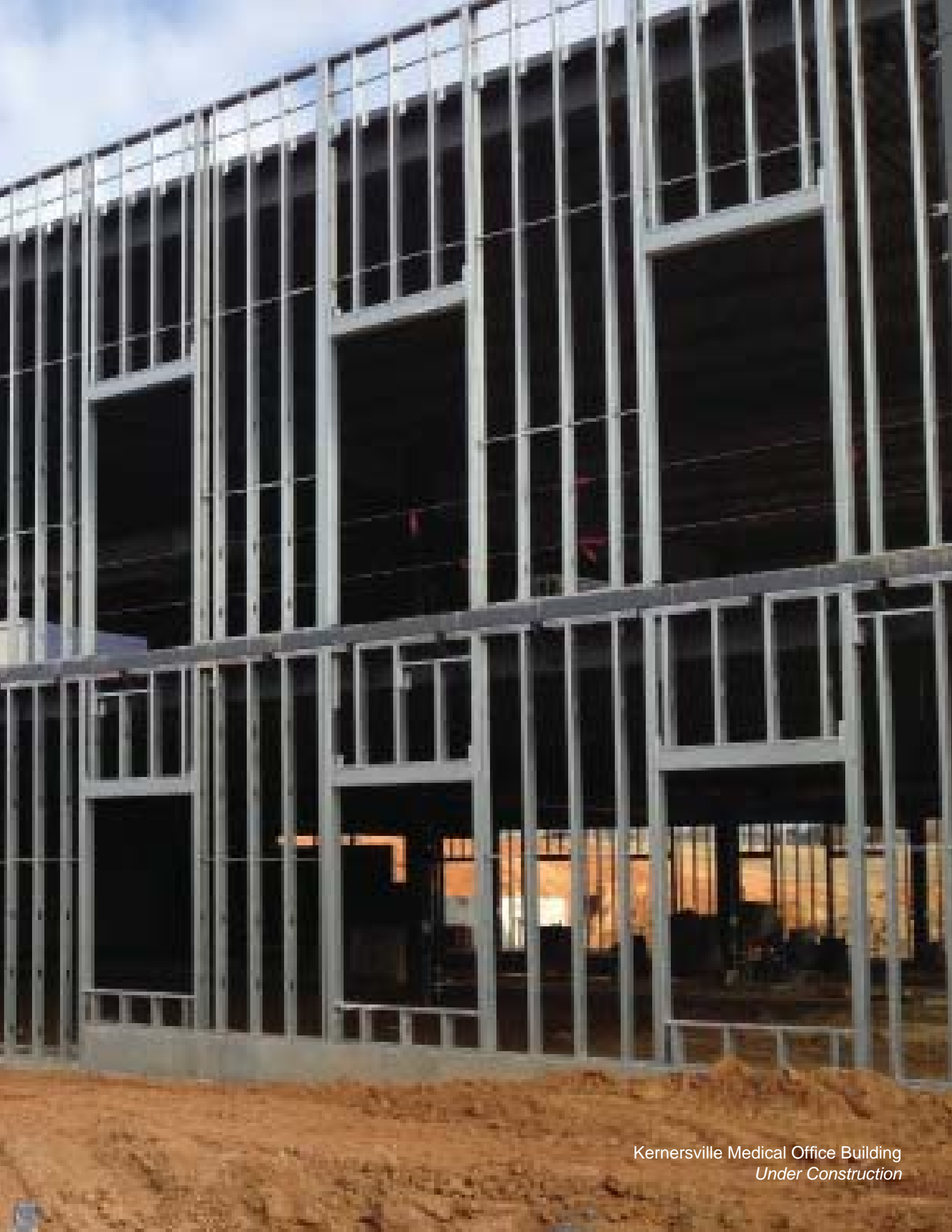
Kenersville Medical Office Building Under Construction