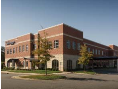
Over ten specialty tenants occupy this 2-story medical office building.