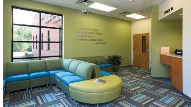
Toli floors in patterns and bright colors provide a welcoming waiting room space.