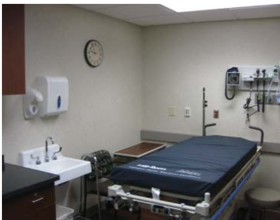
Emergency Department Renovation