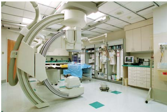
Cardio Vascular Lab Renovation

“Obviously, Landmark has instilled in its employees and subcontractors a level of professionalism that is uncommon in your business.”