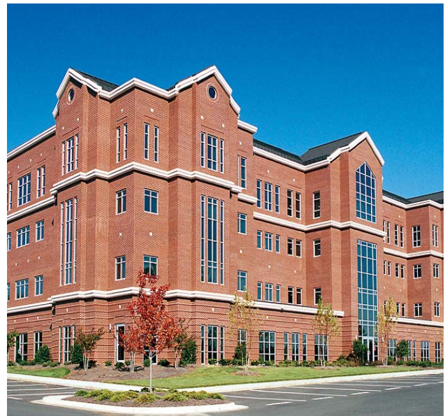
100 Kimel Forest Road

Landmark Builders constructed the exterior signage and hardscape for this project as well.