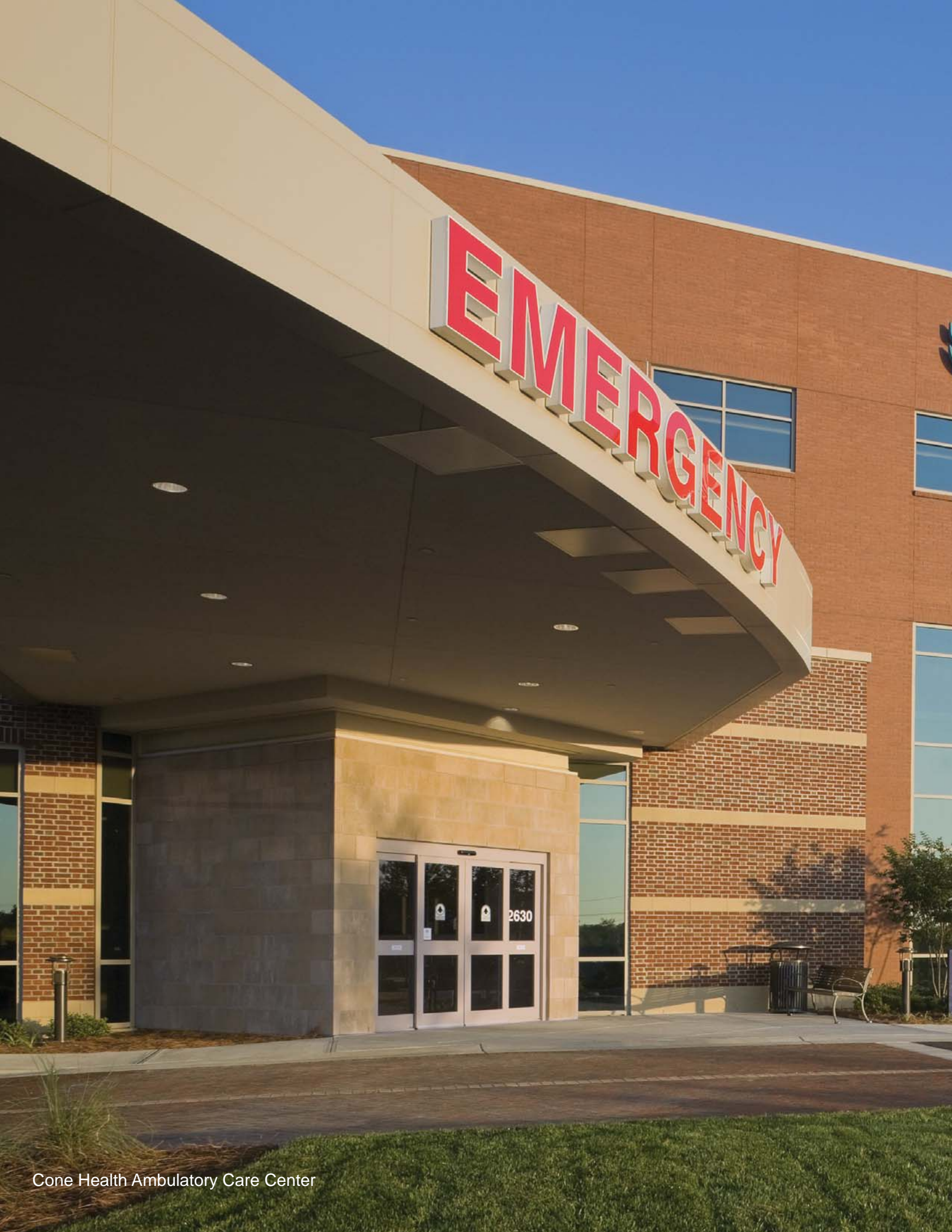
Cone Health Ambulatory Care Center