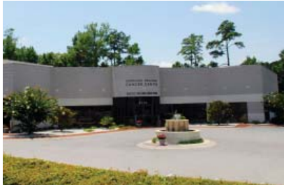
Myrtle Beach, SC