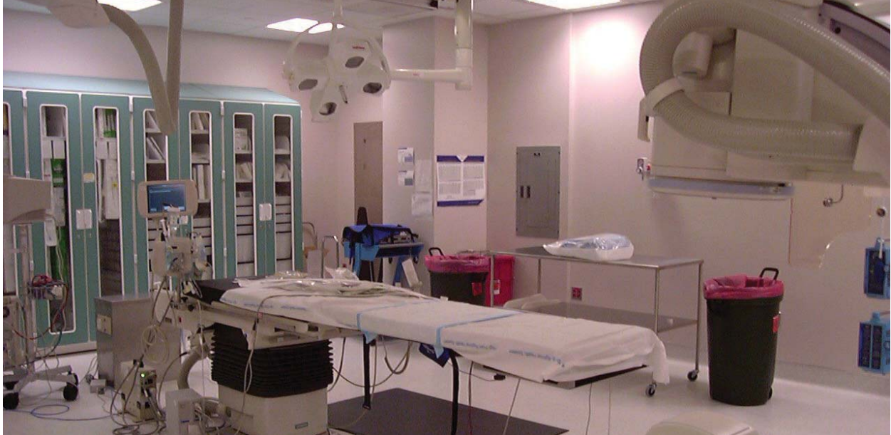
Cardio Vascular Lab Renovation